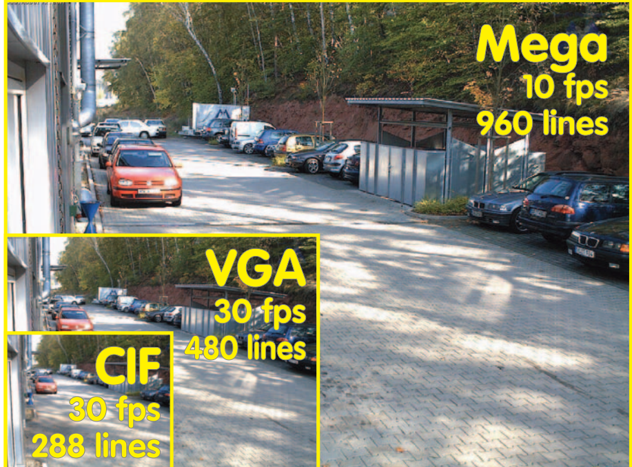
* Original images from the M22-Secure with L43 wide-angle lens

Robust no moving parts fiber glass housing