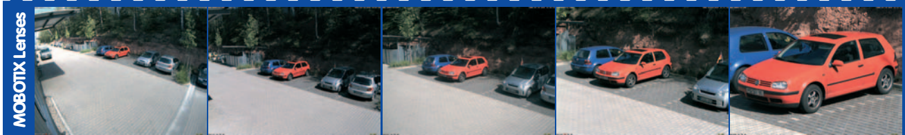
90° hor. x 67° vert. in 10 m: 20.0 x 13.3 m