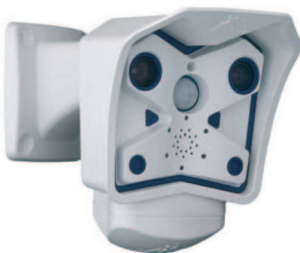
M12D with SecureFlex wall mount